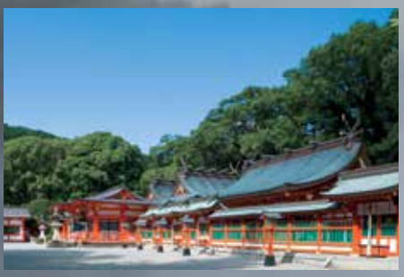
Kumano Hayatama-taisha Shrine