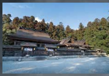
Kumano Hongu-taisha Shrine

It is said that pilgrims in pilgrimage costume crossed a lot of steep mountains to get to Kumano to give a prayer to the deities enshrined there after they had visited Ise-jingu Shrine. Today, you can still enjoy the traditional landscapes and feel the rich history and culture of each area along the "Kumano Kodo Iseji Route."