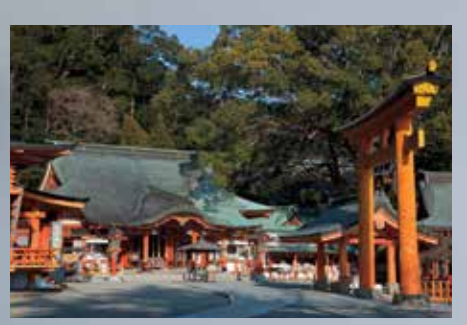
Kumano Nachi-taisha Shrine