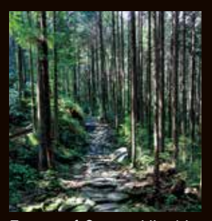
Forest of Owase Hinoki (one of the Three Most Beautiful Artificial Forests in Japan)

The path here is paved with heavy natural stones as if they were lying over one another.